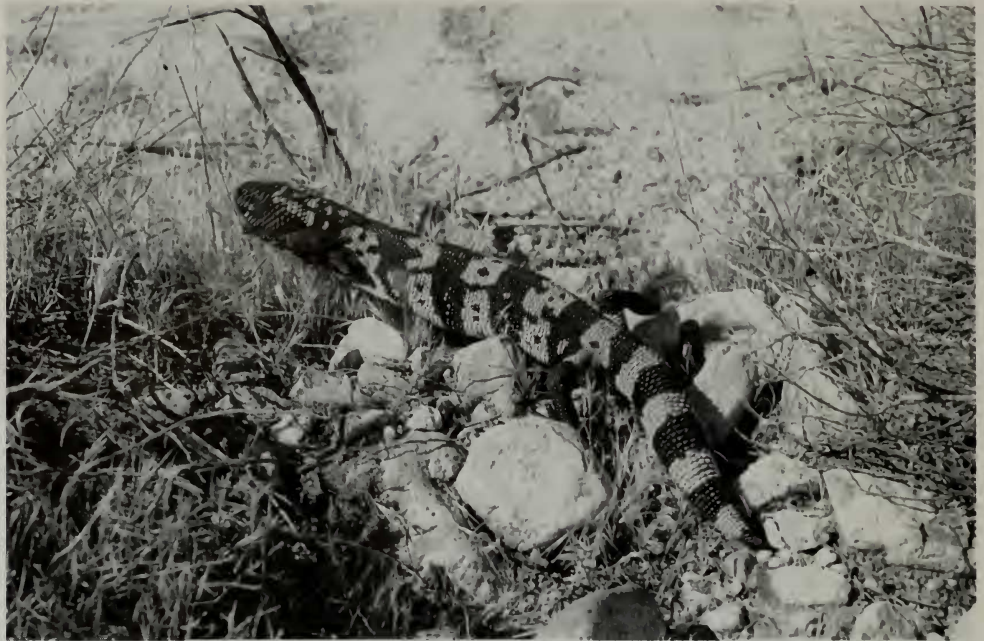
Fig. 6. Gila monster from the Kingston Range, San Bernardino County, California, 1.4 km west Porcupine Flats. Photo by Randall Ford, 30 May, 1980. LACMPC #1329.

Clark Mountain. —At almost 2,400 m, Clark Mountain is the highest of the east Mojave sky island mountain ranges in California. Bradley and Deacon (1966) reported a specimen collected from the eastern slope of the Clark Mountains in 1962 now in the collection of the Marjorie Barrick Museum of Natural History at the University of Nevada, Las Vegas (#R 665, Figure 9). The snout-vent length of the specimen is 267 mm with a total length of 40.5 cm. This collection site is about 11 km southwest of the California-Nevada state line. Several other specimens were reported from nearby Clark County, Nevada, and all were collected at elevations below 1219 m (Bradley and Deacon 1966).